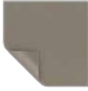
Da-Tex Half Angle: 30° Gain: 1.3