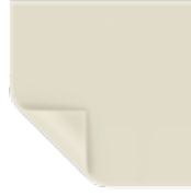
Dual Vision Half Angle: 65° Gain: 0.9