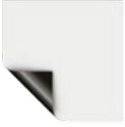
HD Rental Half Angle: 85° Gain: 1.0